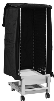
BL-29128 Fits 20-20E, 20-20G