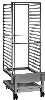
5026385 Fits 20-20E, 20-20G, 20-20MW, and QC3-100